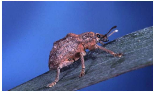
Figure 3. Adult melaleuca weevil.

In the spring of 1997, scientists released the weevil at 13 locations in the infested area (Figure 2).