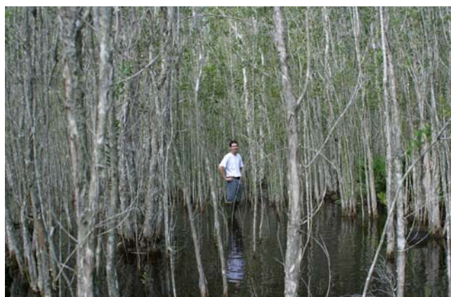
Figure 1. Melaleuca stand in the Florida Everglades.

In 1986, USDA/ARS scientists at the Invasive Plant Research Laboratory in Fort Lauderdale started