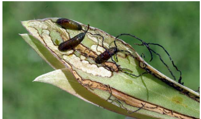
Figure 4. Larvae of melaleuca weevil with fecal coil.

The scientists monitored the weevils spread from these sites from the time of release until 2001, and also characterized the sites by the density of melaleuca per acre, the number of weevils released, number of months during which the ground was inundated with water, predominant wind direction, and time since release. Overall, the weevils moved an average of 0.61 miles per year, with a range of 0.06 (112 yards) to 1.8 miles per year. This is very slow compared to most other newly-released biological control agents. The tree density, time after release, and the number of weevils released influenced the rate of dispersal. The denser the stand of melaleuca, the slower the rate of spread. Also, as may be expected, the greater the amount of time since the release, the farther the insects traveled, and the more insects that were released, the faster they dispersed.