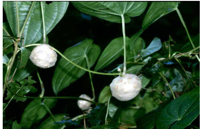
Figure 2. Air potato bulbils form in leaf axils.

Winged yam ( Dioscorea alata ), also a non-native invasive species and similar in appearance, often arises from a massive underground tuber, has opposite leaves, and stems are square in cross section, with corners “winged,” these often red-purple tinged. Our native wild yams, ( D. floridana and D. quarternata ) are infrequent in hammocks and floodplains of north and west Florida, never form aerial tubers, and the leaf blades rarely to 6 in long.