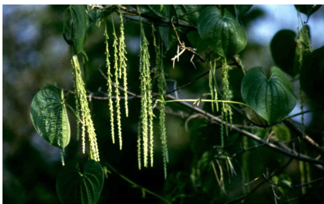
Figure 4. Air potato flowers.