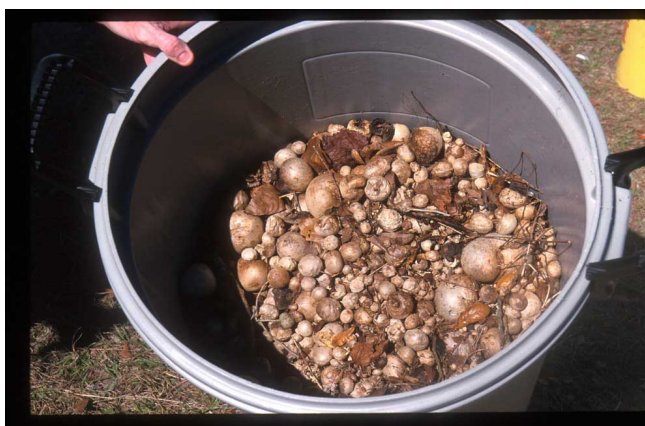
Figure 5. Remove air potato bulbils and other plant material from site and dispose of in such a way that they do not spread the vines to new areas.

Herbicides must be applied according to instructions on the label. It is highly recommended that those who have not had previous training in application of pesticides contact the Cooperative Extension Office in their county for information on training opportunities. Property owners may wish to