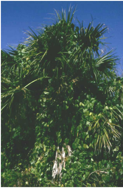
Figure 1. Air potato vine engulfing native cabbage palm.