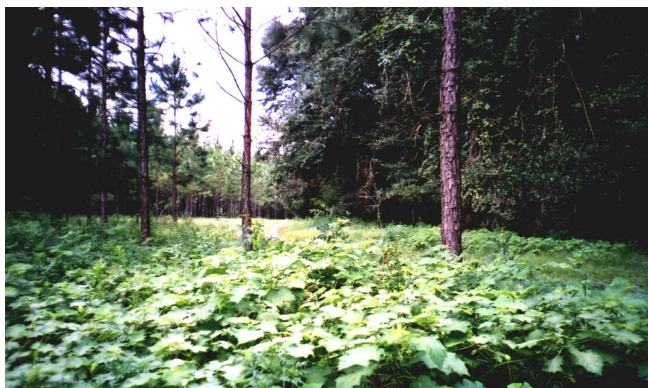
Figure 1. Tropical soda apple in Florida.

Tropical soda apple (TSA), Solanum viarum Dunal (Solanaceae) (Figure 1), is a perennial weed, native to South America, that has spreading throughout Florida at an alarming rate during the last decade. TSA was first reported in Glades County in 1988. This weed is also present in Alabama, Arkansas, Georgia, Louisiana, Mississippi, North Carolina, Pennsylvania, South Carolina, Tennessee, and Texas (Figure 2). Currently, the area infested with TSA is estimated at more than one million acres.