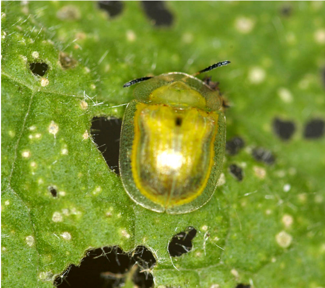
Figure 6. Gratiana boliviana adult.

distinguished by examining the underside of the body. In males, two somewhat rounded orange testes can be observed, one on each side of abdomen. In females there is a pair of white ovaries. Characters for separating the sexes can be observed 3-5 days after eclosion (hatching). Pre-oviposition (pre-egg laying) period takes from 9 to 12 days. Longevity of females averages 3 months.