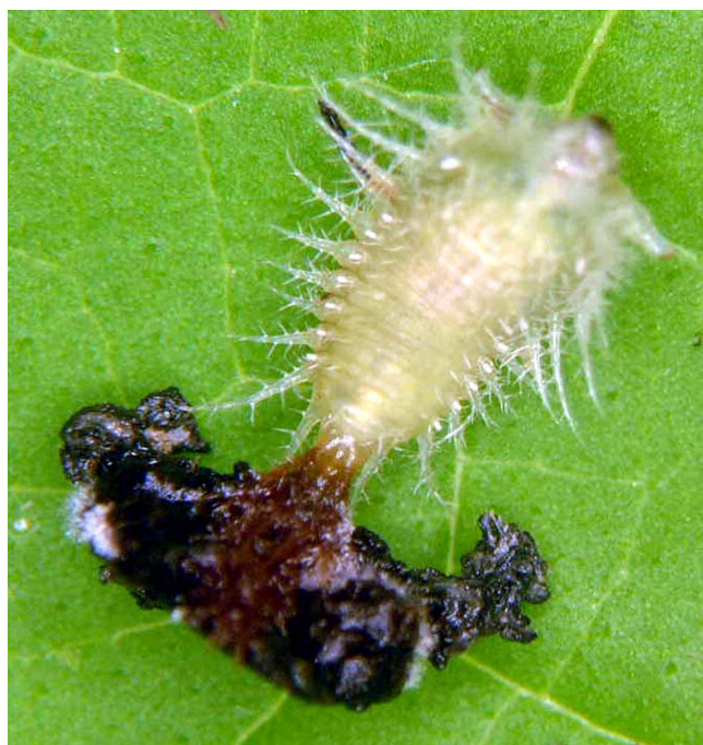
Figure 4. Gratiana boliviana larva.

The pupal stage (Figure 5) is completed in about 6-7 days. The pupae are green colored and dorsal-ventrally (from top and bottom) flattened. Pupae are attached to the leaf by the last abdominal segment. The most common pupation place is the underside of leaves. In severely defoliated plants, some pupae can be found on the petioles and stems.