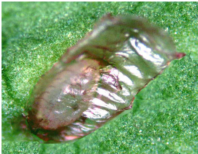
Figure 3. Gratiana boliviana egg.

initially white in color but turn light green during the incubation period. Each egg is enclosed by two translucent brown membranes. The egg case is attached to the leaf surface by one extreme. A female can produce on average 300 eggs. Incubation of the egg takes 5-6 days at a temperature of 25°C.