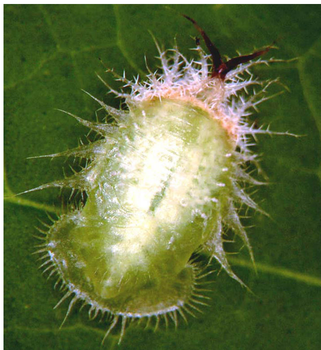
Figure 5. Gratiana boliviana pupa.

General coloration of the young adult is light green. Along the margin of the elytra (front wings) there is a continuous yellow band. The rest of the elytra is light green with irregular yellowish areas between rows or depressions (Figure 6). Mature adults turn a uniform yellow. Females and males can be