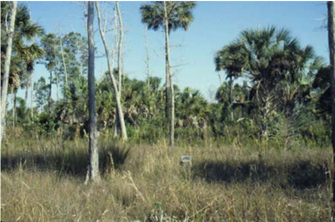
Figure 1. Designating certain lands to be managed (or restored) as natural areas is one method of protection for native plant and animal communities.

More than one-half of Florida's land area is in agricultural or urban land uses, and native habitats are continually being lost. Continued urbanization is an inevitable consequence of increasing population, and food production by agriculture is essential. However, preserving and protecting Florida's native habitats for historical significance and to protect native species, water quality and water quantity is also essential. Natural areas have been designated on federal, state, county, city, and private lands ( Figure 1 ).