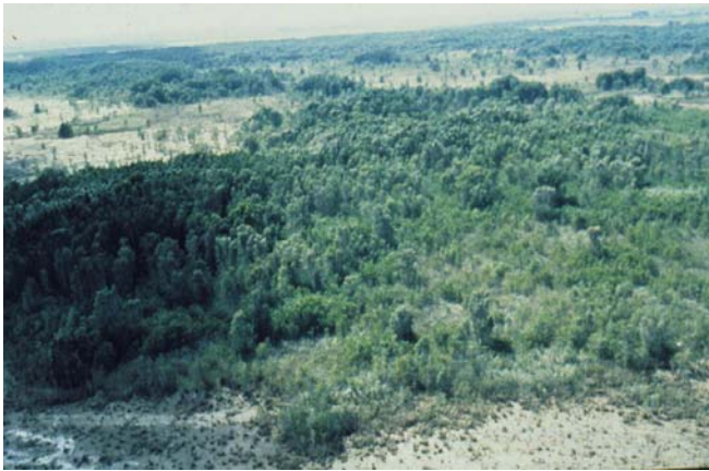
Figure 7. Melaleuca, or Australian paperbark ( Melaleuca quinquenervia ), once widely planted in Florida, now forms dense thickets and displaces native vegetation on 391,000 acres of wet pine flatwoods, sawgrass marshes, and cypress swamps in the southern part of the state. It is prohibited by DEP and listed as a noxious weed by FDACS.