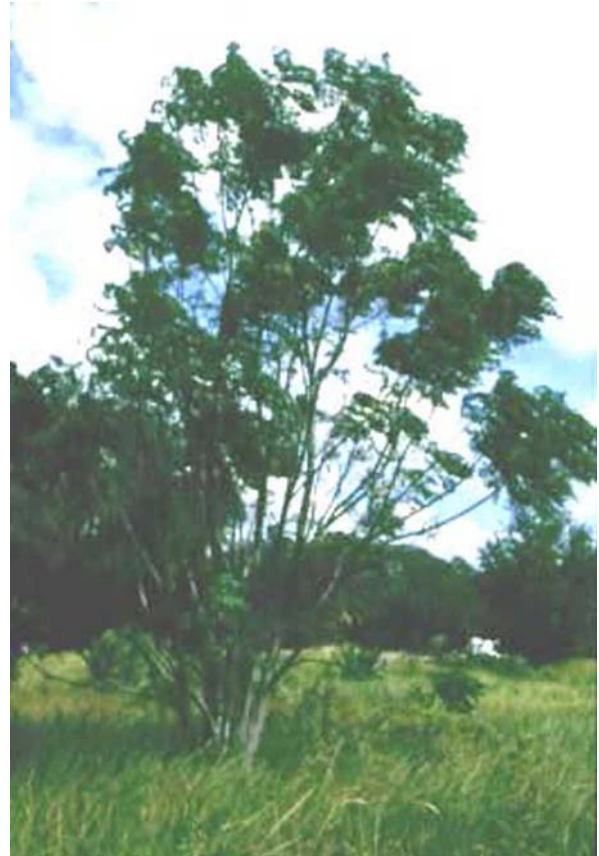
Figure 15. Chinaberry (Melia azederach) occurs primarily in disturbed areas such as rights-of-way and fencerows and has begun invading floodplain hammocks, marshes, and upland woods, particularly in north Florida. It is not statutorily prohibited, but it is listed as invasive by the Florida EPPC, and its use has been discouraged by the FNGA.

Removing non-native invasive plants from private property can eliminate a major source of