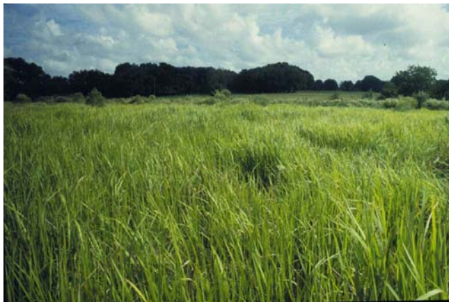
Figure 2. Cogongrass ( Imperata cylindrica ) has invaded many habitats such as sandhills, flatwoods, grasslands, swamps, river margins, and dry sand dunes throughout Florida and other southeastern states. It is listed as a noxious weed by FDACS and USDA.

Florida Department of Environmental Protection's (DEP) Prohibited Aquatic Plant List ( http://www.dep.state.fl.us ) Plants that occur on at least one of these lists and may occur on private property in Florida include cogongrass ( Imperata cylindrica , Figure 2), Brazilian pepper tree ( Schinus terebinthifolius , Figure 3), Australian pine ( Casuarina spp., Figure 4), tropical soda apple ( Solanum viarum , Figure 5), catclaw mimosa ( Mimosa pigra , Figure 6), Australian paperbark ( Melaleuca quinquinervia , Figure 7), and Chinese tallow ( Sapium sebiferum , Figure 8), Old World climbing fern ( Lygodium microphyllum , Figure 9), carrotwood ( Cupaniopsis anacardioides , Figure 10), air potato ( Dioscorea bulbifera , Figure 11) and skunk vine ( Paederia foetida , Figure 12). In addition to plants that are regulated at the federal and state levels, 21 Florida counties and cities have ordinances that prohibit planting or require removal of 45 non-native plant species.