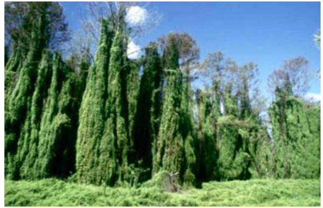
Figure 9. Old World climbing fern ( Lygodium microphyllum ) aggressively invades cypress swamps and tree islands in south Florida and carries both wildfires and prescribed burns through natural barriers. It is listed as a noxious weed by FDACS.