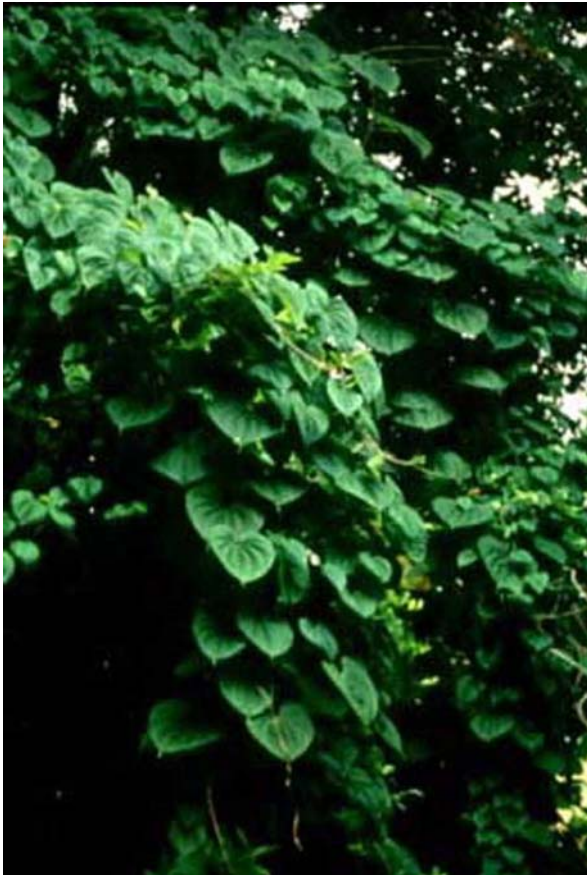
Figure 11. Air potato ( Dioscorea bulbifera ) can climb high into tree canopies and engulf surrounding vegetation. It is listed as a noxious weed by FDACS.