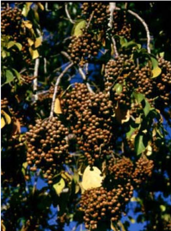
Figure 14. Bischofia (Bischofia javanica) is a weedy tree in landscapes. It is common in old fields and disturbed wetland sites and also invades intact cypress domes and tropical hardwood hammocks of south Florida. It is not statutorily prohibited, but it is listed as invasive by the Florida EPPC, and its use has been discouraged by the FNGA.

available for sale from the IFAS Extension Bookstore at http://ifasbooks.ufl.edu (Ph: (352) 392-1764).