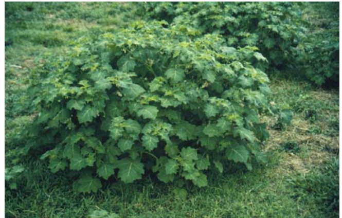
Figure 5. Tropical soda apple ( Solanum viarum ), first collected from Florida in 1988, is now a common weed on 500,000 acres of pastures, roadsides, ditchbanks, cultivated land and natural areas. It is prohibited by DEP and listed as a noxious weed by FDACS and USDA.