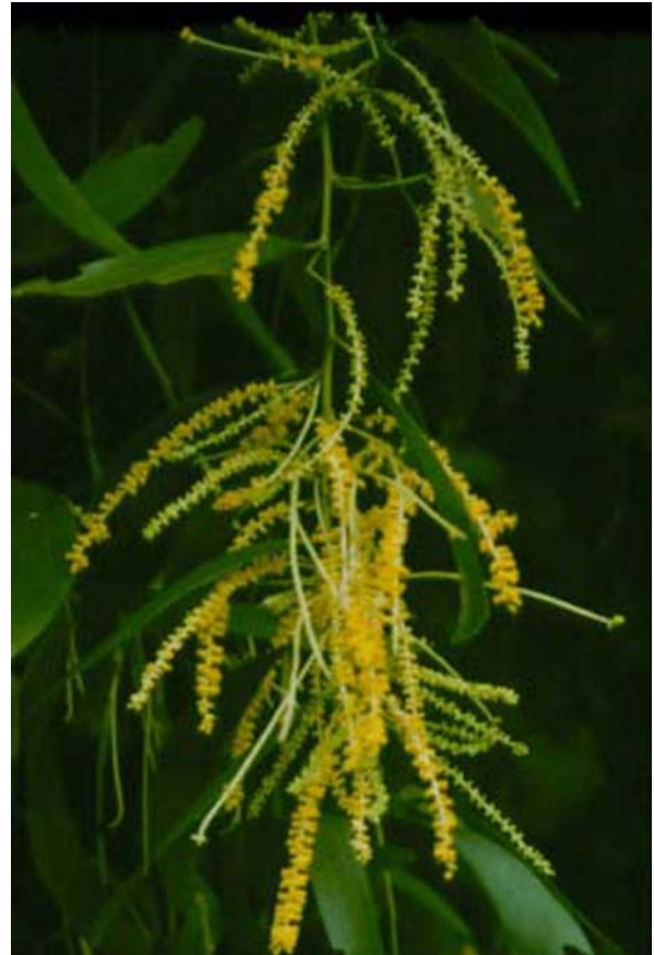
Figure 13. Earleaf acacia ( Acacia auriculiformis ), a messy tree in landscapes, invades disturbed areas as well as pinelands, scrub, hammocks, and pine rocklands in south Florida. It is not statutorily prohibited but is listed as invasive by the Florida EPPC.