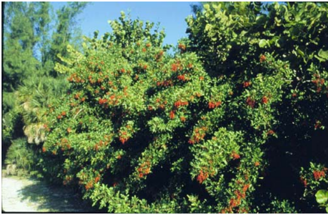
Figure 3. Brazilian pepper tree ( Schinus terebinthifolius ) was introduced to Florida in the 1840s as a cultivated ornamental. It is an extremely invasive plant that invades fallow farmland, pinelands, and hardwood hammocks of south and central Florida, and mangrove forests as far north as Levy and St. Johns counties. It is prohibited by DEP and listed as a noxious weed by FDACS.