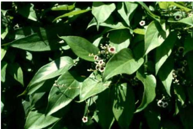
Figure 12. Skunk vine ( Paederia foetida ) invades native plant communities in Florida and can create dense canopies leading to the death of native vegetation. The plant emits a foul odor, especially when the leaves are crushed. It is listed as a noxious weed by FDACS.

agricultural crops, and by accident. They now exist in our landscapes, and some are still sold commercially. Invasive non-native plants growing in proximity to natural areas are a source of invasion. Seeds and