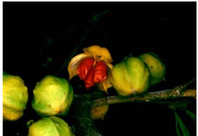
Figure 10. Carrotwood ( Cupaniopsis anacardioides ) is a popular landscape tree throughout southern Florida. It produces large crops of seed, which are eaten and transported by birds. It is now naturalized on spoil islands and in tropical hammocks, pinelands, mangrove swamps, cypress domes, scrub, and coastal strand communities. It is listed as a noxious weed by FDACS.