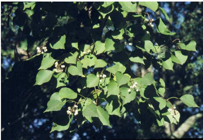
Figure 8. Chinese tallow ( Sapium sebiferum ), sometimes called popcorn tree, has been considered an invasive pest plant in the Carolinas since the 1970s and is expanding its range on the US Gulf Coast through Florida. It is widely dispersed by birds and thrives in undisturbed areas such as closed canopy forests, bottomland hardwood forests, shores of water bodies, and sometimes on floating islands. It is listed as a noxious weed by FDACS.