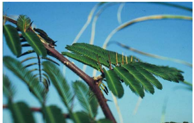
Figure 6. Catclaw mimosa ( Mimosa pigra ) is a sprawling, prickly shrub that was first identified in Florida in 1953 and now occurs on 1,000 acres of river floodplain, swamp forest, and lake margins in Broward, Palm Beach, Marin, St. Lucie, and Highlands counties. It is prohibited by DEP and listed as a noxious weed by FDACS and USDA.

EPPC list itself does not carry statutory authority. Examples of EPPC "Category I" plants (in addition to the ones already listed as prohibited) include earleaf acacia ( Acacia auriculiformis , Figure 13 ), bischofia ( Bischofia javanica , Figure 14 ), and Chinaberry ( Melia azedarach , Figure 15 ). The EPPC list is modified as merited by new observations. A copy of the EPPC's list of Florida's invasive plants can be obtained by contacting your County Cooperative Extension Service office, the UF/IFAS Center for Aquatic and Invasive Plants (352-392-9614) or on the EPPC Web site ( http://www.fleppc.org ).