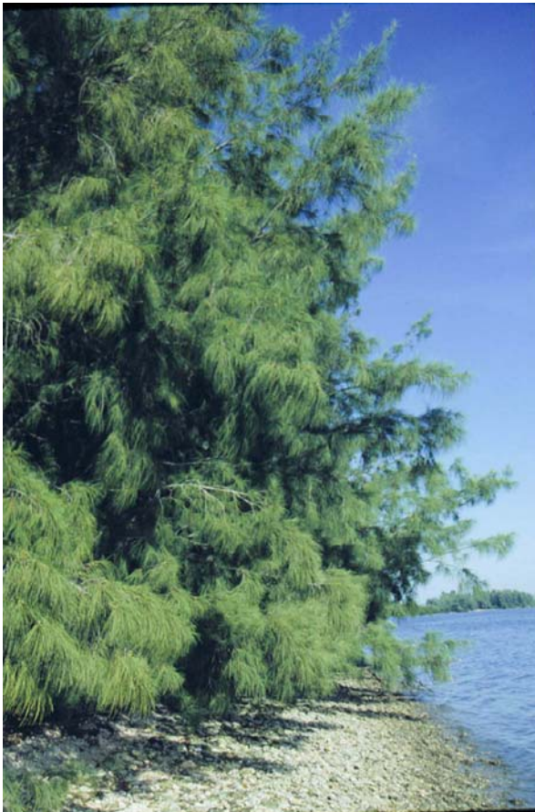
Figure 4. Australian pine ( Casuarina equisetifolia ) was introduced to Florida in the late 1800s and planted extensively in the southern half of the state. It is salt-tolerant and invades pinelands, sandy shores, and front-line dunes where it produces dense shade, litter accumulation and displaces native vegetation. It is prohibited by DEP. Credits: