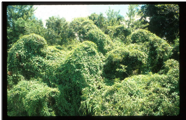
Figure 1. Skunkvine growing over native shrubs.