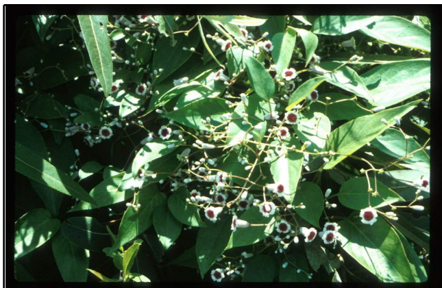
Figure 3. Skunkvine flowers.

tube (corolla) with 5 (usually) spreading lobes; corolla density hairy (Figure 3, Figure 5).