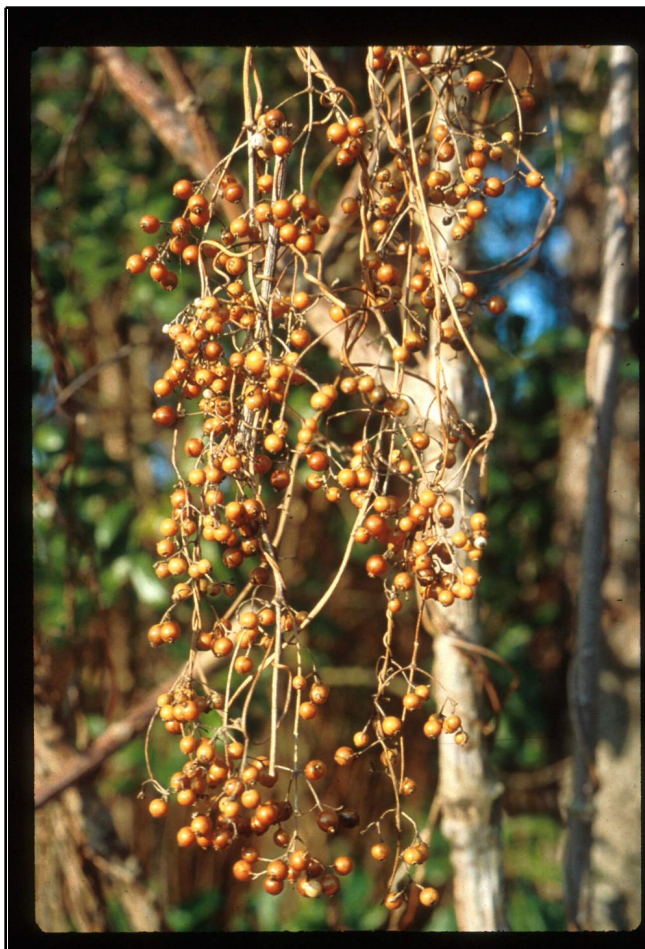
Figure 4. Mature skunkvine fruits.