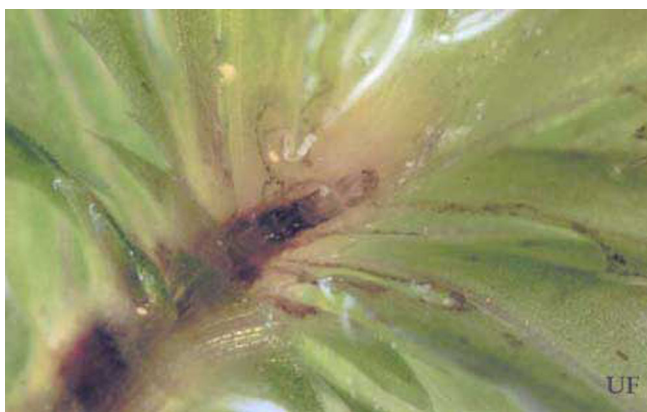
Figure 5. Hydrilla tip damage and larva of "hydrilla tip mining midge," Cricotopus lebetis Sublette.