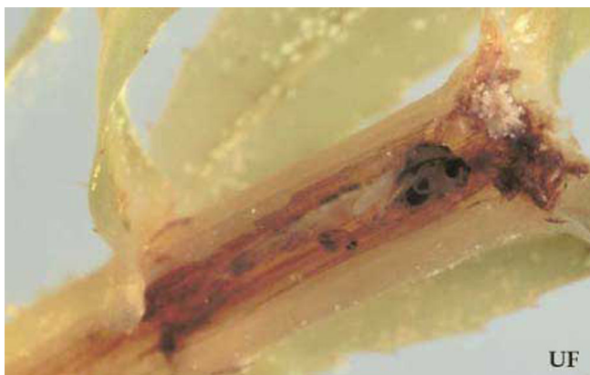
Figure 7. Damaged hydrilla tip with pupa of "hydrilla tip mining midge," Cricotopus lebetis Sublette.