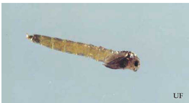
Figure 6. Female pupa of "hydrilla tip mining midge," Cricotopus lebetis Sublette.