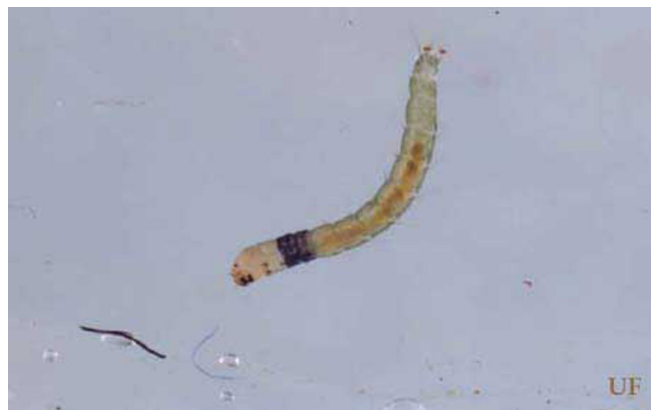
Figure 4. Larva of "hydrilla tip mining midge," Cricotopus lebetis Sublette.

Larva: The larvae of Cricotopus lebetis can be identified by the color and general appearance of the body. Live or freshly-preserved specimens have a characteristic green body color with a broad dark blue band around the thorax. After the body color fades in preserved specimens, the larvae can be separated from other midge larvae by the presence of a pair of lateral setae on each abdominal segment.