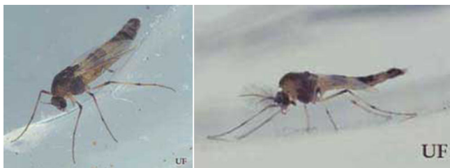
Figure 2. Lateral views of adult female (left) and male (right) "hydrilla tip mining midge," Cricotopus lebetis Sublette.

Egg: The egg mass is linear shaped, and contains from 50 to 250 eggs diagonally-arranged in one or two rows encased in a sticky gelatinous tube. The eggs are white in color when first laid, and resemble a string of pearls. Within 24 hours the eggs that have been fertilized turn grayish-brown, and red eyespots of the fully formed embryo appear just prior to hatching.