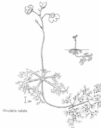
Utricularia radiata Bladderwort