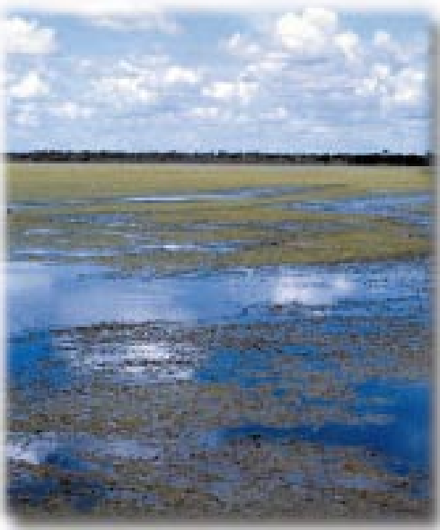
In Lake Trafford, Collier County