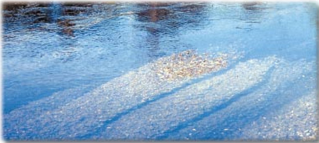
In canal, Indian River County