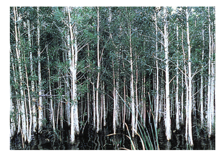
Dense melaleuca tree stand in a Florida waterway.