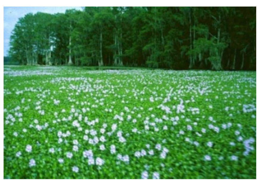
Dense water-hyacinth mat in a Florida waterway

Water-hyacinth mats lower dissolvedoxygen concentrations, damaging fish populations.