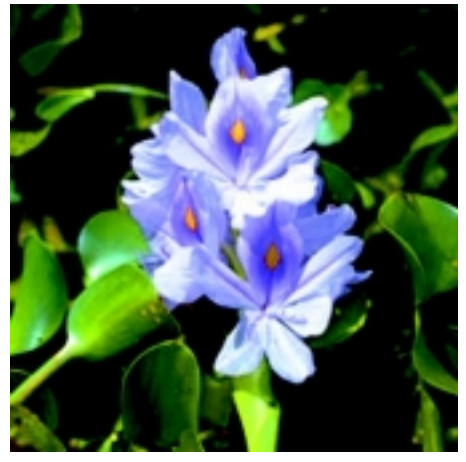
A beautiful flower, but a major invasive weed species since the late 1890's

Water-hyacinth - This native of South America is now considered a major weed species in more than 50 countries. The floating water-hyacinth was introduced into Florida in the 1880s and covered more than 120,000 acres of public lakes and navigable rivers by the early 1960s. Since then, intensive management efforts coordinated by the Florida Department of Environmental Protection and the U.S. Army Corps of Engineers have reduced water hyacinth to approximately 2,000 acres statewide.