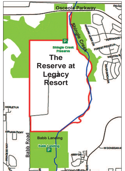
Osceola County map

The Reserve at Legacy Resort, shown above within the red line, has been added to the active acquisition list for Osceola County's land conservation program.