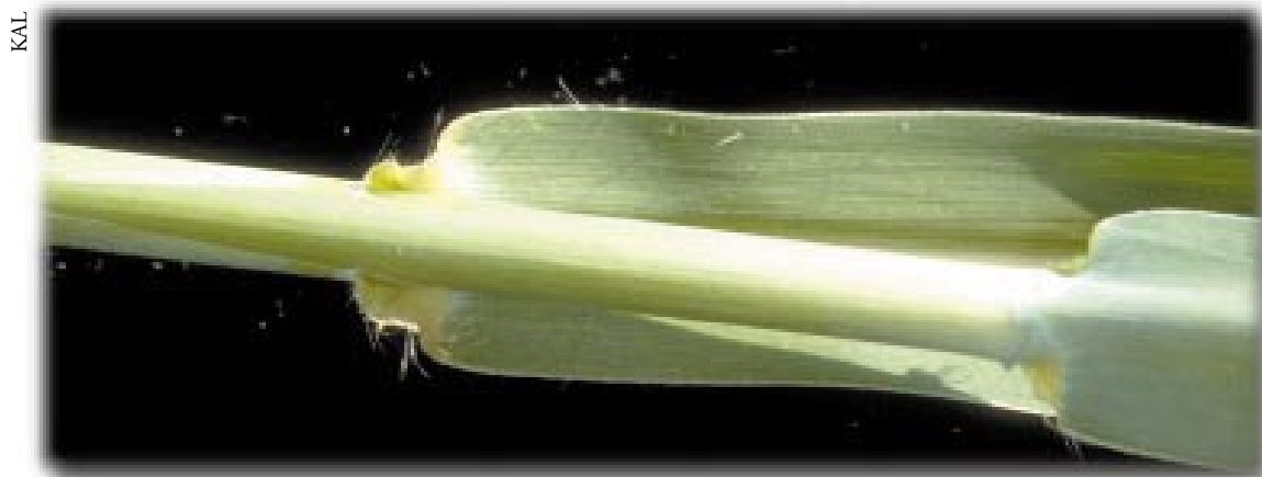
Sheath tops, blade bases