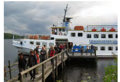
Field trip participants visited lakes and rivers in central Finland.

An all day (and half of the night) field trip visiting lakes and rivers of central Finland occurred on Thursday from 9:00 AM – 11:30 PM. Finland has over 187,888 lakes with about 30% of them larger than three acres. Many of the lakes are located in the area around Jyväskylä. Participants were transported 125 miles around the Finnish Lake District with stops made at clear water lakes, eutrophic lakes, regulated lakes, rapids, small and large rivers. At each stop, indicator plants were identified and the status of the lake or river was discussed. A traditional Finnish lunch was served at Holiday Farm Salvia. In the afternoon, participants took a two hour boat tour of Lake Päijänne, the second largest (275,796 acres) and the deepest lake (313 feet) in Finland. The evening ended with the symposium dinner at Savutuvan Apaja, an old traditional style Finnish farmhouse and cottage. The EWRS recognized five students who were awarded 4000 Euros ($5900) to attend the symposium. Contingents from Finland, Russia, Poland, and England serenaded the crowd with songs from their country land.