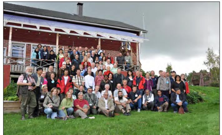
The participants of the aquatic weeds symposium during the field excursion.

In recent years, the interest in aquatic macrophytes has grown further for their role in monitoring water quality, treatment of waste waters, and also in climate change. There has been a shift in focus from the “control” of “weeds” to their management in a larger ecosystem perspective. Numerous papers presented at