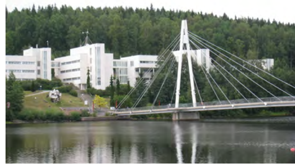
Lake Jyväsjärvi and symposium site at the University of Jyväskylä.