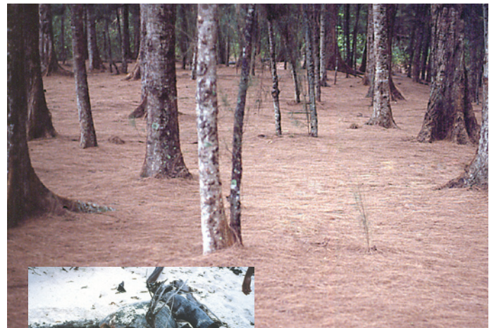
Australian pine forest with no understory vegetation.

Several species of Casuarina were introduced from Australia to Florida during the 1890s. Although commonly called pines, these plants are angiosperms, not conifers. Australian pines were widely planted in Florida to form windbreaks around canals, agricultural fields, roads and houses. Habitats disturbed by both human activities and natural events seem particularly prone to invasions by Australian pine. Because Australian pine trees are resistant to salt spray, and can grow close to sea water, they have invaded thousands of acres of southeastern and southwestern coastal areas of Florida.