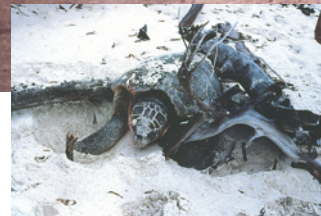
Sea turtle trapped in Australian pine roots on a Florida beach.

Because of its aggressive growth rate, never plant Australian pine trees. There are native trees that provide shade and do not harm the environment. Possession of Australian pine with the intent to sell or plant is illegal in Florida without a special permit.