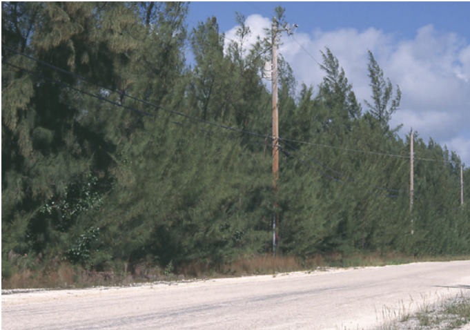
Australian pines in the Florida Keys