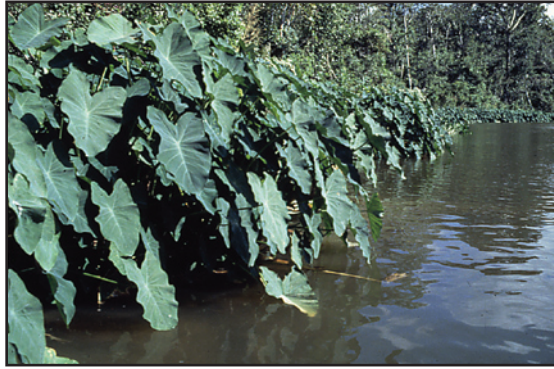
Wild taro along a Florida waterway.

Wild taro may be confused with other plants in Florida that have large arrowhead-shaped leaf blades, such as the nonnative elephant ear ( Xanthosoma sagittifolium ) and the native arums ( Peltandra spp. ). Only taro has leaf stalks attached to the back of the leaf blade.