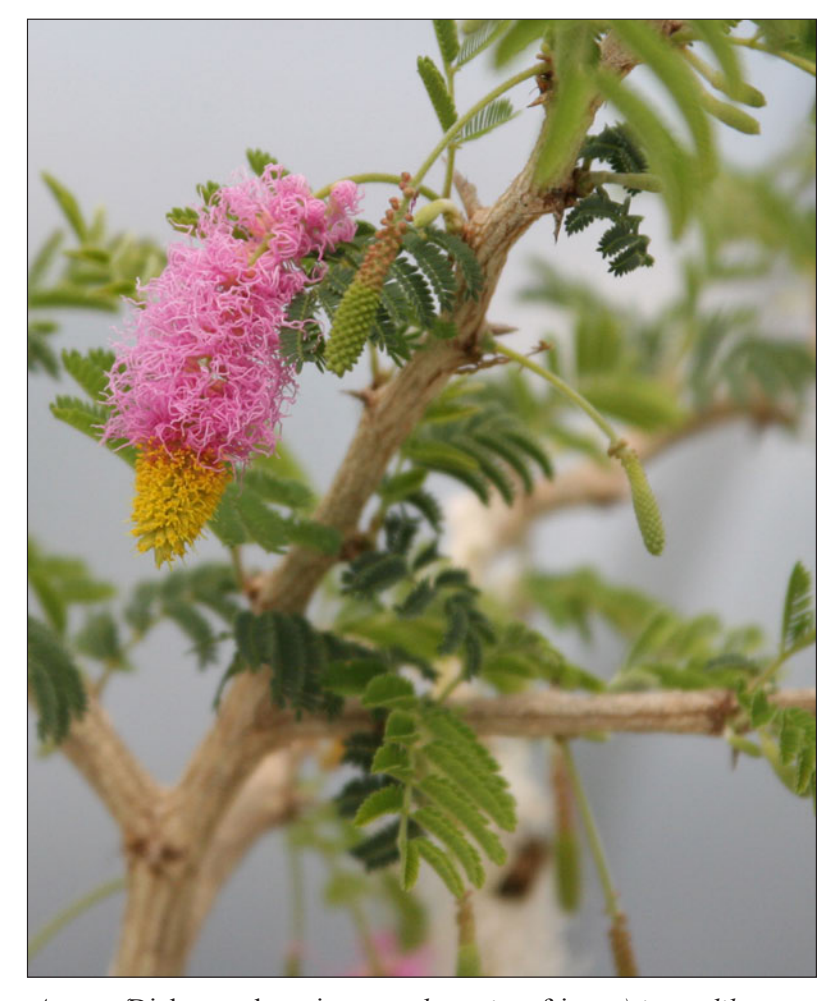
Aroma (Dichrostachys cinerea subspecies africana) is readily available in the international, national, and local trade. It is touted on the Web as an interesting specimen for the landscape, and an appealing bonsai species. Photo by C. Jacono, March 2010. See article on page 3 of this issue.