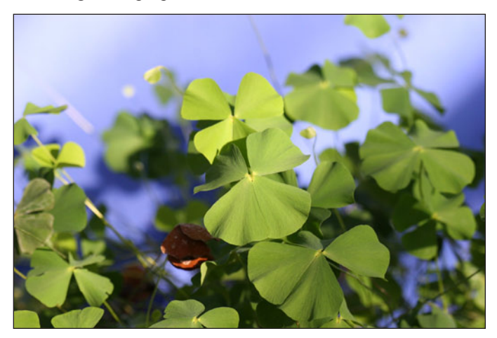
DNA "fingerprint" analysis was used to clarify the endemism of this water clover fern (Marsilea) which was previously considered introduced in central Florida.

Under a research grant from the South Florida Water Management District, the agency that oversees water resources in the southern half of Florida, we are using seed storage and greenhouse regeneration trials to understand the early life history processes crucial to the establishment and persistence of Tropical American watergrass (Luziola subintegra). Although Neotropical in origin, the endemic distribution of this "rice-related" species is not clear because, based on botanical records, it has moved significantly in recent decades in the greater Caribbean Basin. Since its 2007 discovery in Florida, and despite a concerted regimen of herbicide treatment, Tropical American watergrass has spread in Lake Okeechobee, and invaded a restoration wetland on the eastern margin of Everglades National Park. We are learning how hydrology interacts with seed survival in the soil and with seedling regeneration in the colonization of new sites. At the same time we are identifying and monitoring the response of associated plant species at the Everglades site, in order to better guide restoration processes. These applied studies focused on providing immediate information needed by land managers to accurately predict population dynamics in conjunction with their ongoing herbicide applications for management purposes.