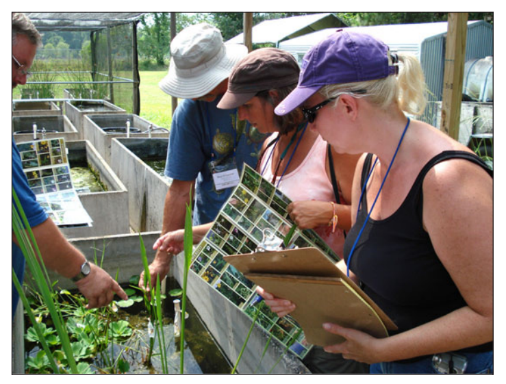
PLANT CAMP participants compete in a hands-on plant identification quiz to sharpen their observation and identification skills.

termine (1) if they are using their training and materials, and (2) if they experienced an increased awareness, understanding, and acceptance of the plant management practices they learned about during their training and use of materials.