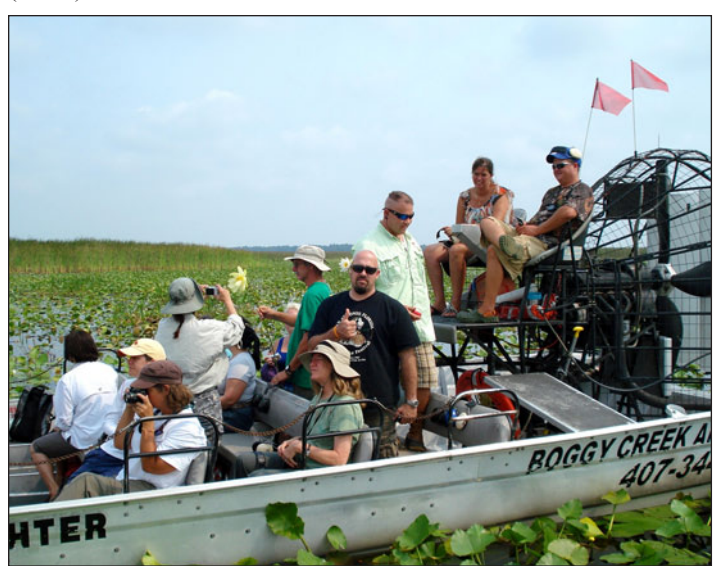
PLANT CAMP participants visit Lake Tohopekaliga (Toho) in Osceola County—a "quintessential" multiple-use Florida waterbody that supports eco-tourism (airboat and birding tours); bass fishing, and duck hunting, while also serving as a federal flood control project. The arrival of endangered snail kites a few years ago further complicated largescale hydrilla management. The snail kites depend on an invasive apple snail for food, which in turn feeds on the invasive aquatic plant, hydrilla.

Toward this end, UF/IFAS CAIP collaborated with dozens of teachers to develop curriculum about aquatic and upland invasive plants in Florida. Several audio-visual presentations and a host of learning materials have been developed for use in the classroom as a result. The on-going project has been made possible through a collaborative effort of CAIP and the Invasive Plant Management Section of the Florida Fish and Wildlife Conservation Commission (FWC).