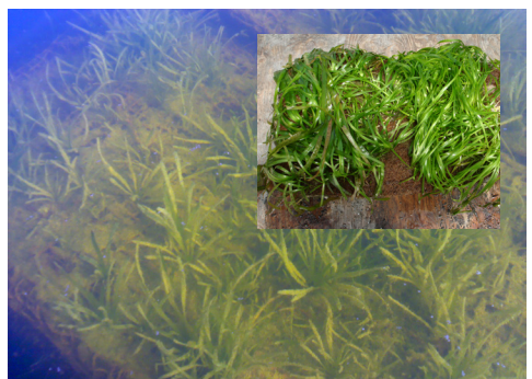
Fig. 2. Well-rooted eelgrass sod in a large coir matrix after 16 weeks of greenhouse culture. Inset: Eelgrass sod removed from the tank for transport to the field.

provided handles either end on of the roll. This process was fairly quick (a 15' long piece of sod could be rolled in 5 minutes) and resulted in an easy-to-transport unit. Although a rolled 3' x 15' section of eelgrass sod is fairly heavy when saturated, the coir