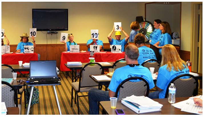
Teachers from PLANT CAMP play students' role in Lakeville: A Natural Resource Management Game

Lakeville is accompanied by a 250 page Unit Guide, which includes Teacher Guides and activities for all three sessions. Teacher Kits were produced that include the Unit Guide as well as classroom sets of activity booklets