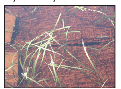
Fig. 1. Well-rooted ramets of eelgrass inserted into openings of the coir rope net wrapped around the coir pillow.

eelgrass sod could not be scaled up for production of large eelgrass sod without modifications. The tank became murky within a week and an algae bloom reduced water clarity to virtually zero. Pumps and biofilters were installed in an attempt to control the algae without success. The algae impeded the growth of the eelgrass by blocking sunlight and smother-