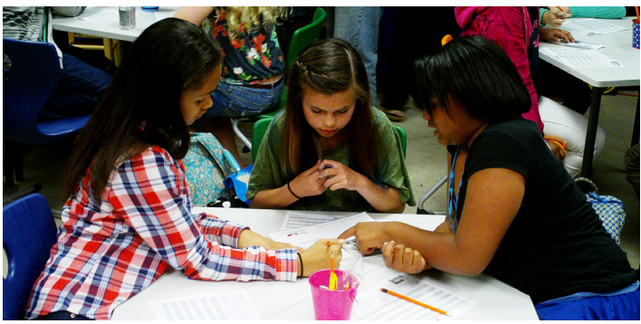
Three students from PK Yonge work together to fill out score sheets for Lakeville

Thanks to generous funding from the Florida Fish and Wildlife Conservation Commission (FWC), the Aquatic Plant Management Society (APMS), the Aquatic Ecosystem Restoration Foundation (AERF), and the Florida Aquatic Plant Management Society (FAPMS), the Lakeville Unit was demonstrated in 10 Florida classrooms this past year, and will be brought to 14 more this coming school year.