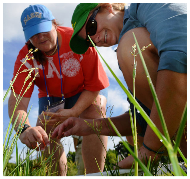
PLANT CAMP participants get their hands dirty inspecting critters during a pond ecology lab

University of Florida faculty, FWC regional and state park biologists, administrators from FWC's Invasive Plant Management Section, and plant managers from