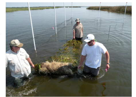
Fig. 3. Field installation of eelgrass sod by UF and FWC personnel.

The large sections of eelgrass sod were transplanted to field plots in August 2011. Site visits to Lake Jesup dur-