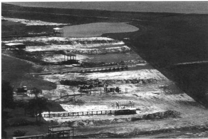
Thousands of truckloads of muck were removed. About half the muck was trucked to upland pastures and other disposal sites.