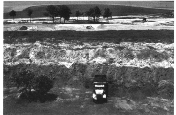
About half of the muck was used to construct in-lake wildlife islands.