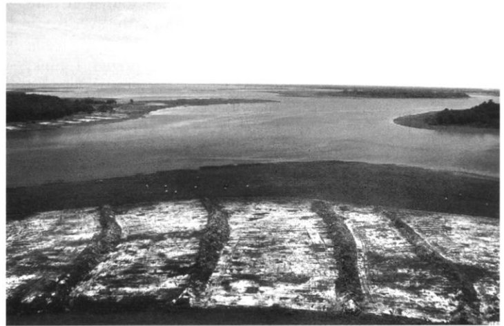
Bulldozers scraped more than 3,700 acres of the exposed bottom of Lake Toho. Here, rows of muck await removal.