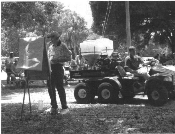
Participants learn how to calibrate a granular herbicide blower mounted on the back of an all-terrain vehicle (ATV).

Mark your calendars for the 2005 Aquatic Weed Control Short Course: May 16 th -20 th , 2005, Fort Lauderdale, Florida. See: http://conference.ifas.ufl.edu/aw/