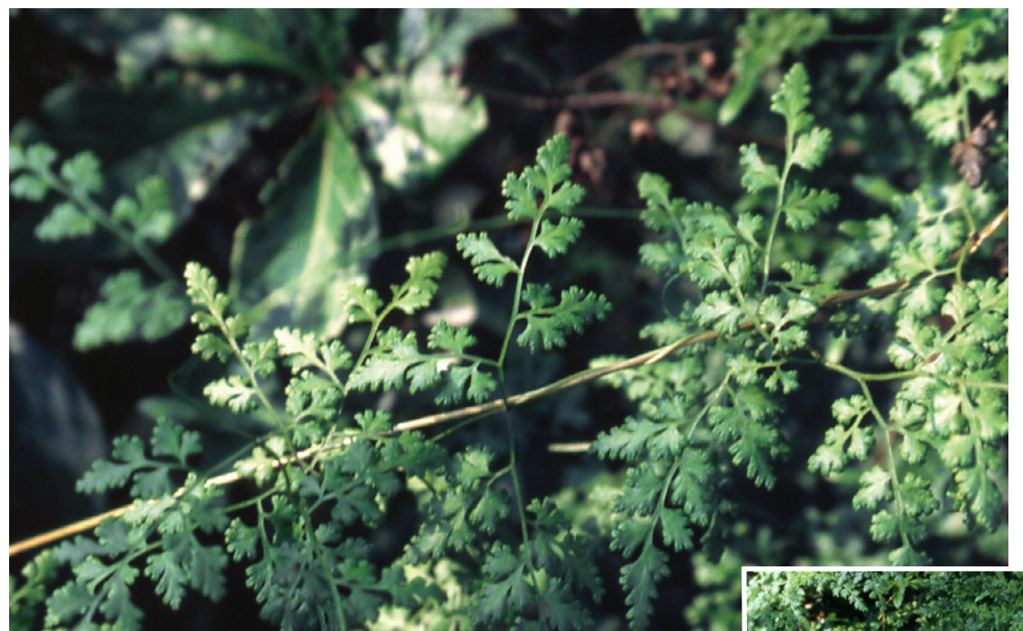
Left and Below: Fertile leaflets of Japanese climbing fern

shrubs and into the tops of trees where its dense canopies shade out and eliminate the vegetation below. It was likely introduced into Florida as an ornamental plant in 1932. Japanese climbing fern appears to be rapidly spreading in North and West Florida, but also may pose a significant threat to Central Florida.