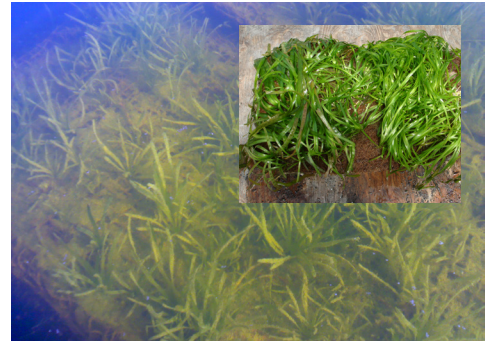
Fig. 2. Well-rooted eelgrass sod in a large coir matrix after 16 weeks of greenhouse culture. Inset: Eelgrass sod removed from the tank for transport to the field.

After 16 weeks of greenhouse culture, all mats hosted robust populations of eelgrass (Fig. 2 and inset photo). Transport to the field was accomplished by rolling each 3'-wide piece of sod onto a 4' length of aluminum fence post, which acted as a spool and provided handles on either end of the roll. This process was fairly quick (a 15' long piece of sod could be rolled in 5 minutes) and resulted in an easy-to-transport unit. Although a rolled 3' x 15' section of eelgrass sod is fairly heavy when saturated, the coir