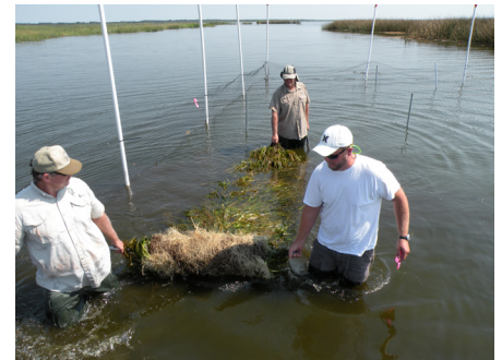
Fig. 3. Field installation of eelgrass sod by UF and FWC personnel.

drains rapidly and weighs approximately 50 pounds within a few minutes of being removed from the tank. The sod is rolled with the shoots of the eelgrass inside and the drained coir retains enough water to ensure that plants do not desiccate during short transport periods. Rolled eelgrass sod is then loaded onto a boat, transported to the revegetation site, unrolled on the bottom of the site, and secured with custom-fabricated landscape "staples" with 1' legs and a 3' span (Fig. 3).