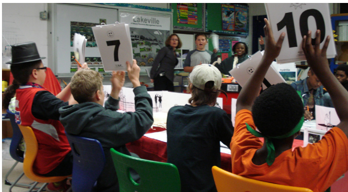
Students from PK Yonge Developmental Research School participate on the Citizen Advisory Panel during Lakeville