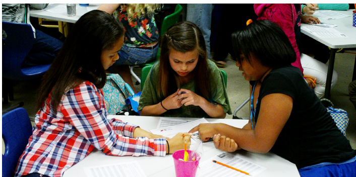
Three students from PK Yonge work together to fill out score sheets for Lakeville

Thanks to generous funding from the Florida Fish and Wildlife Conservation Commission (FWC), the Aquatic Plant Management Society (APMS), the Aquatic Ecosystem Restoration Foundation (AERF), and the Florida Aquatic Plant Management Society (FAPMS), the Lakeville Unit was demonstrated in 10 Florida classrooms this past year, and will be brought to 14 more this coming school year.