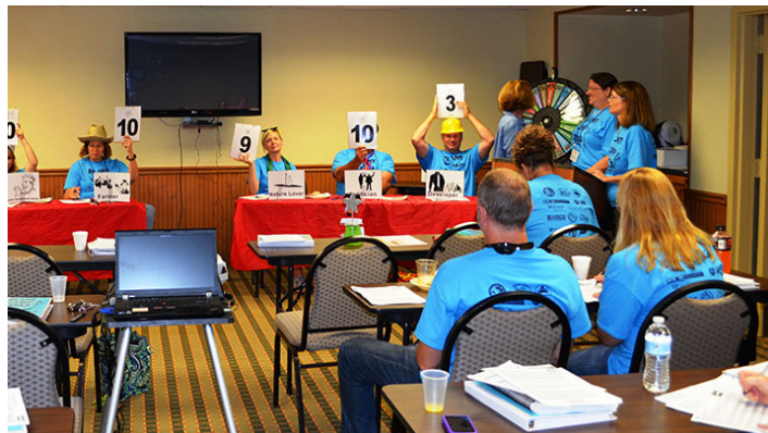
Teachers from PLANT CAMP play students' role in Lakeville: A Natural Resource Management Game

Lakeville is accompanied by a 250 page Unit Guide, which includes Teacher Guides and activities for all three sessions. Teacher Kits were produced that include the Unit Guide as well as classroom sets of activity booklets