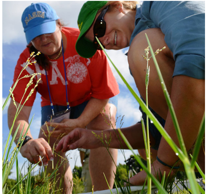
PLANT CAMP participants get their hands dirty inspecting critters during a pond ecology lab

University of Florida faculty, FWC regional and state park biologists, administrators from FWC’s Invasive Plant Management Section, and plant managers from