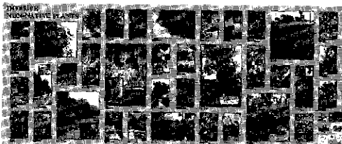
# SP-292 • 23" x 60"