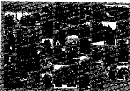
# SP-328 • 27" x 39"