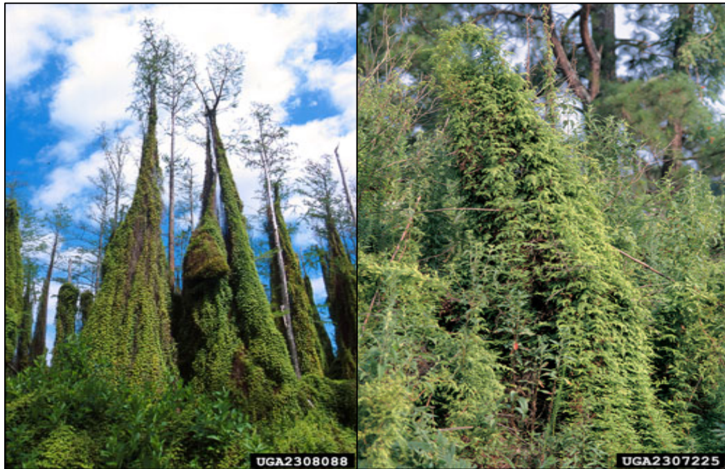
Left: Lygodium microphyllum on cypress trees. Right: Lygodium japonicum in pine forest.