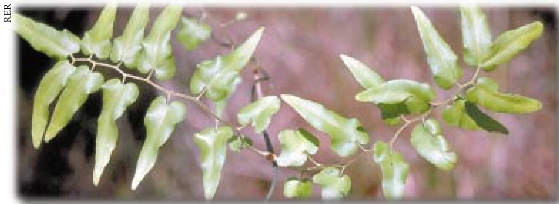
Section of rachis with pinnae

Ecological Significance: Considered a principal agricultural weed in Malaysia and present as a weed in Vietnam (Holm et al. 1979). Reported from Florida natural areas of Broward, Highlands, Lee, Martin, Palm Beach, and Sarasota counties (EPPC 1996). In 1993, infested 1,233 acres (11% of the area) of Jonathan Dickinson State Park and the Loxahatchee National Wild and Scenic River, including many acres of cypress swamps (Roberts and Richardson 1995). By 1995, infested 17,000 acres (12% of the area) of the Loxahatchee National Wildlife Refuge (Palm Beach County), blanketing entire tree islands and even clambering over sawgrass in standing water (Jewell 1996). Poses management problems for both wildfires and prescribed burns because growth into canopy creates an avenue for fire to spread where swamp waters have usually provided a natural barrier. Has caused loss of some canopy trees with such “crown” fires, as well as loss of native bromeliads residing on tree trunks (S. Farnsworth, Palm Beach County, 1995 personal communication; Roberts 1996).